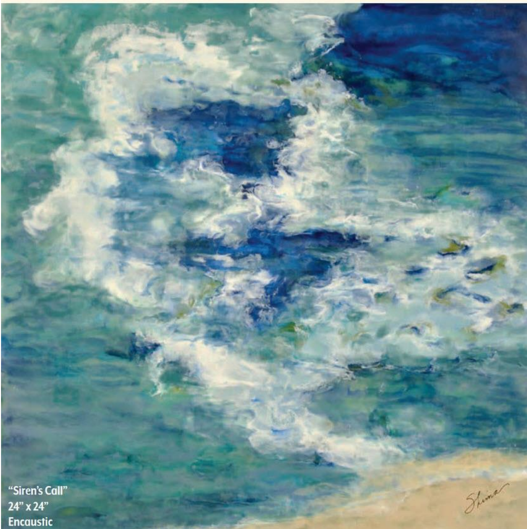
"Siren's Call" 24" x 24" Encaustic