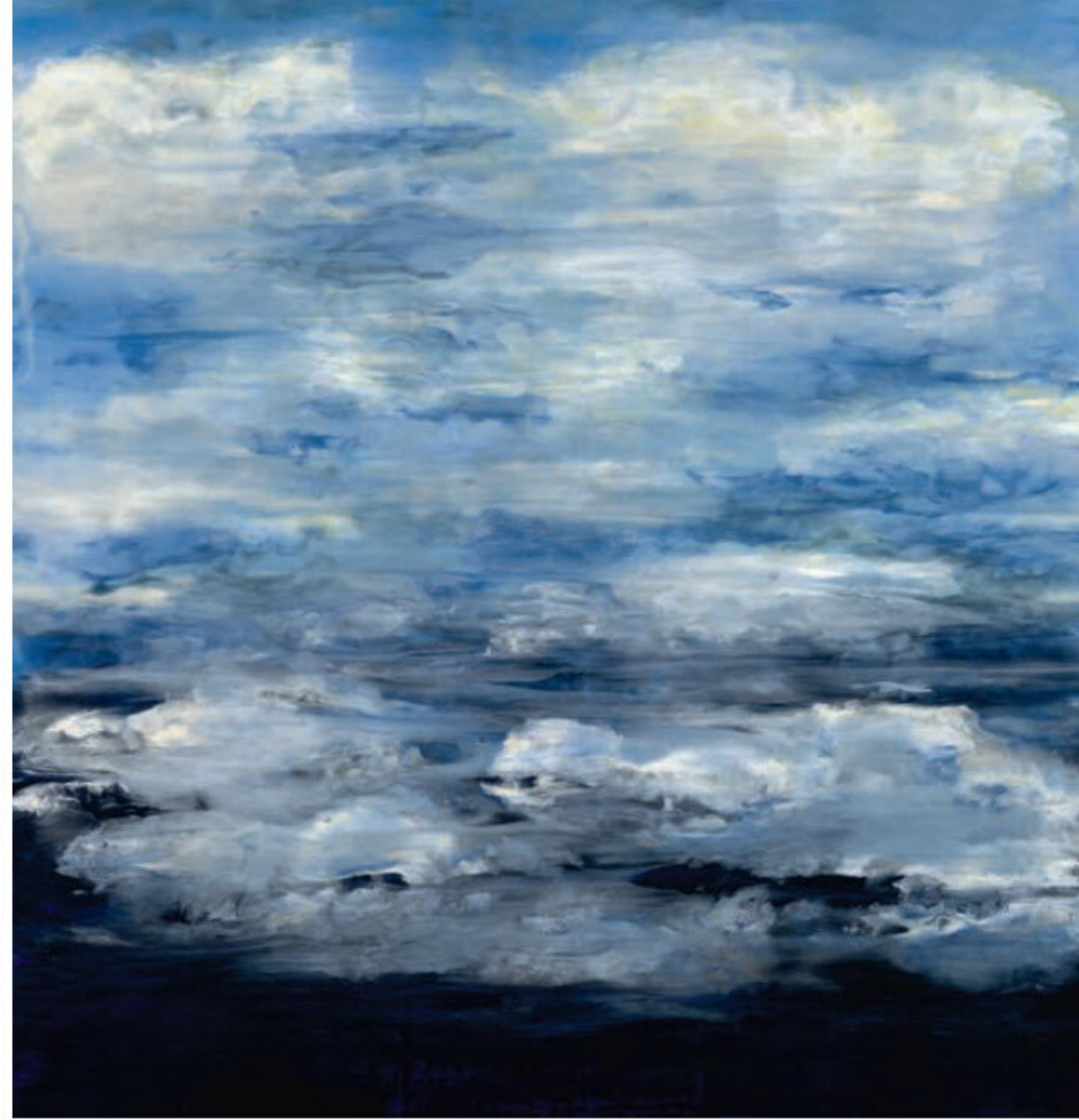
Cloud Speak, encaustic, 36 x 36"