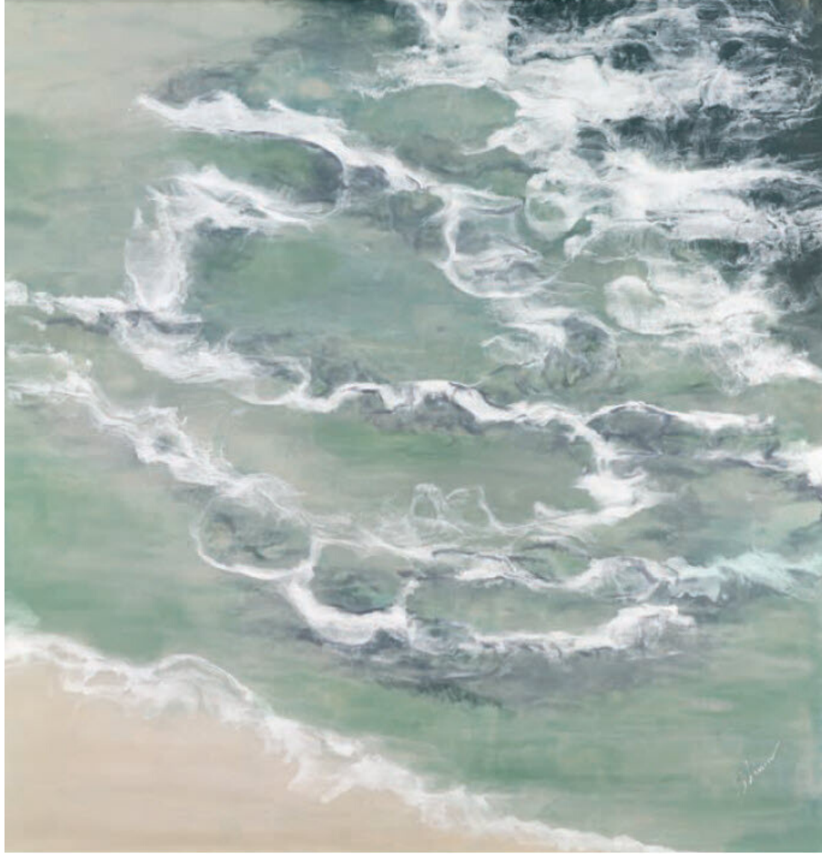
Intuiting the Divine, encaustic, 36 x 36"